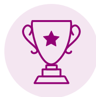
ENABLING OUR SUCCESS